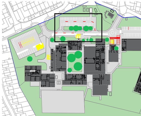
Location Plan Not to Scale