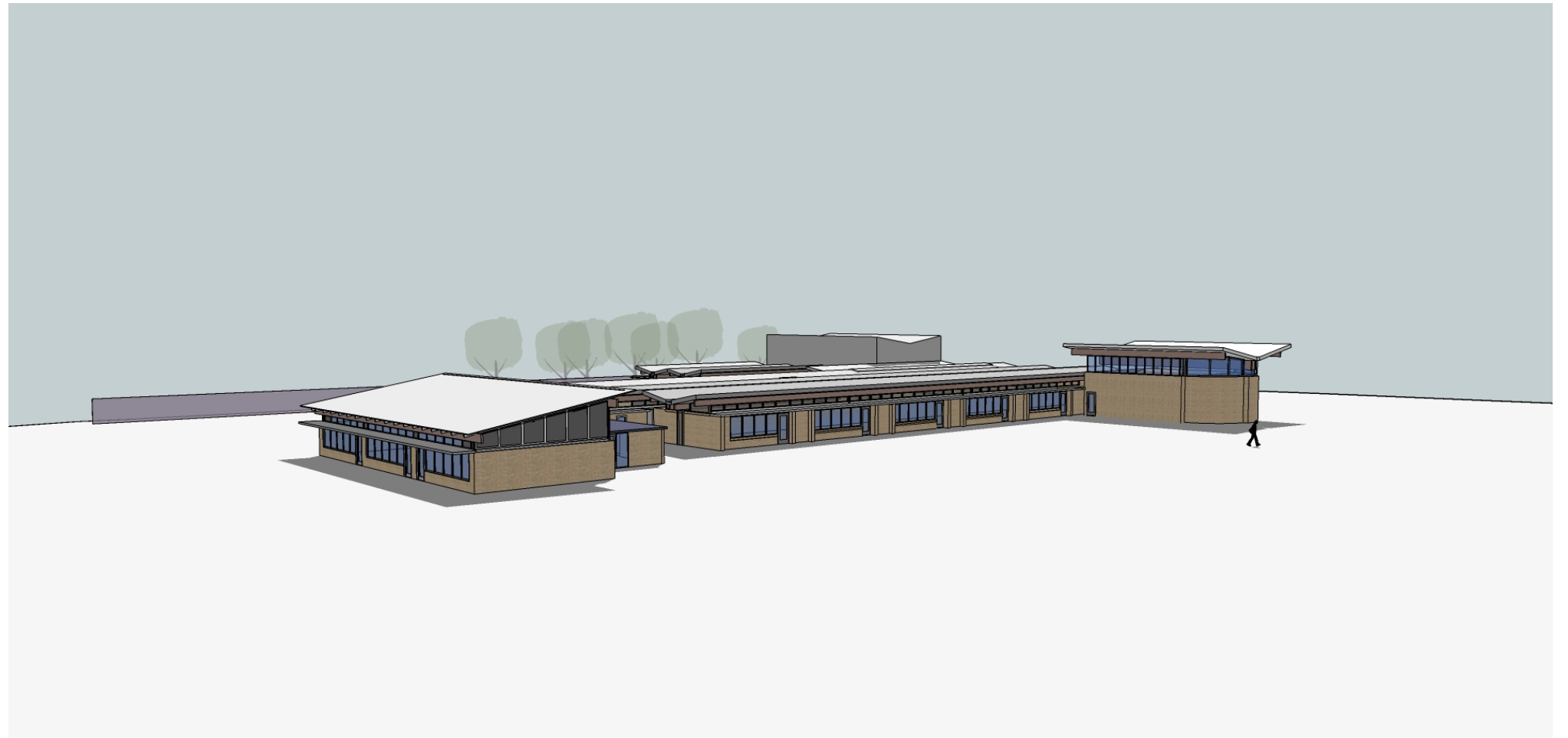
Aerial Perspective of Three Classroom Extension with Existing School