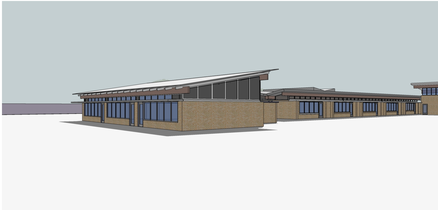
Perspective of Three Classroom Extension from North West