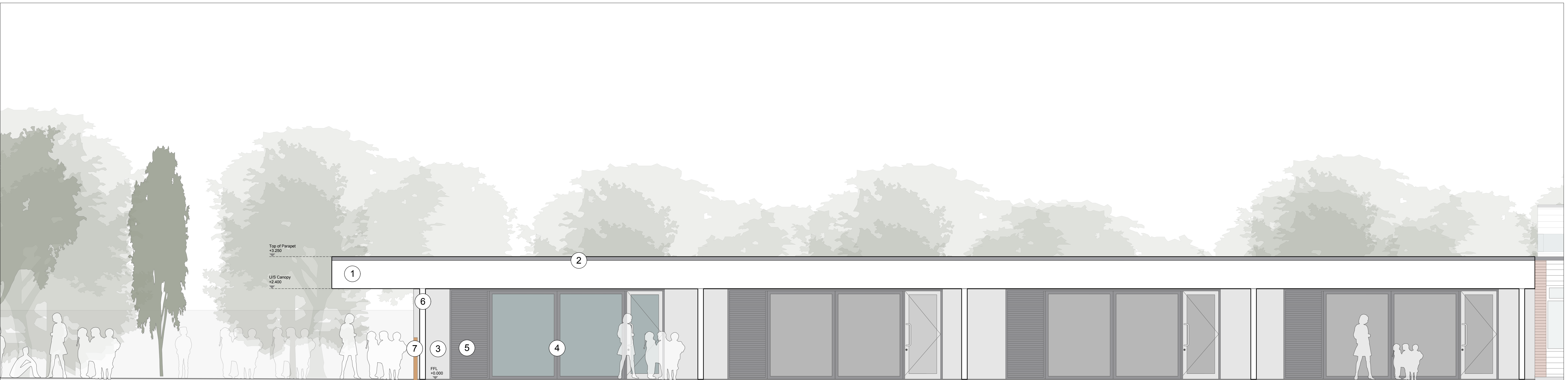
North Elevation BB