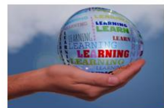
Key Information and Resources