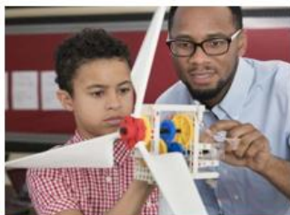
School and Education Settings