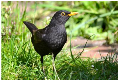
A blackbird looking for nesting material