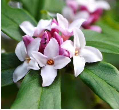
Daphne flowers – you may well smell these before you see them!

Spring is arriving. The days are getting longer and the weather is warming up. The Gardens are waking up. The buds on the plants are swelling, and leaves and flowers are opening. As you walk round the Gardens today, see how many of the following signs of spring you can spot. Keep looking for further signs of spring in the coming weeks.