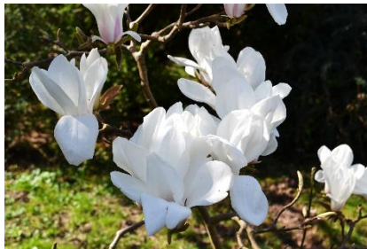
Furry magnolia bud opening