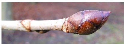
Horse chestnut sticky buds – have any opened yet? Come back in the autumn and see if you can find any conkers!