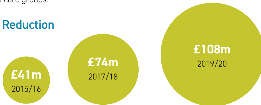
Adult Social Care Cumulative Net Budget Reduction since 2015