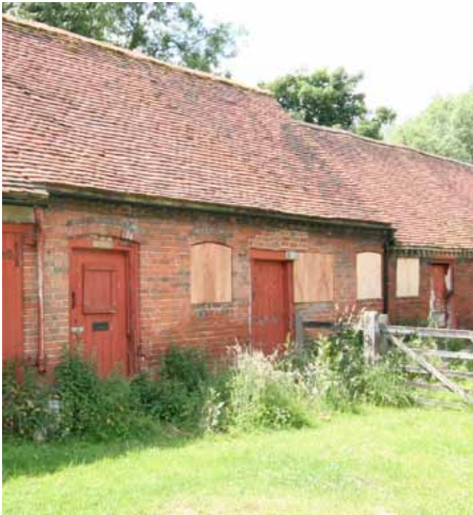
Stable Block before