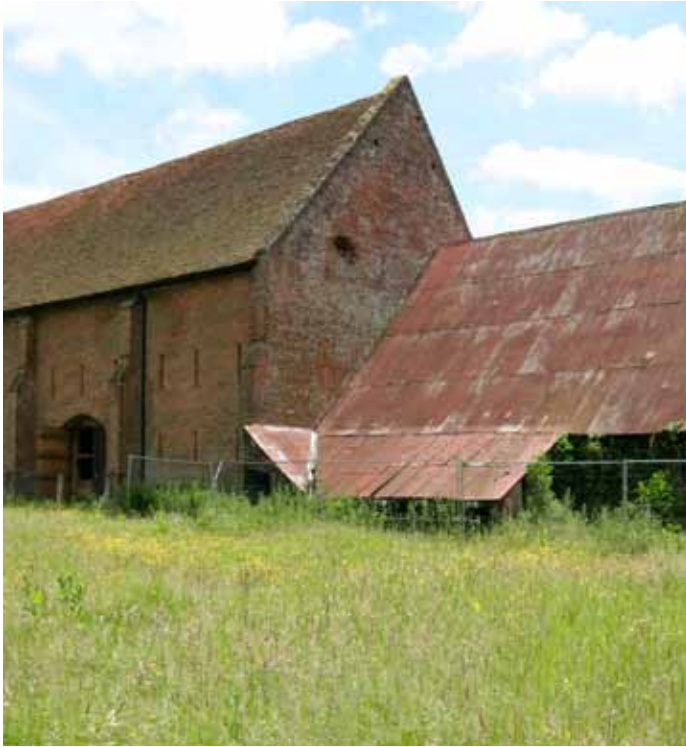
Shop Entrance before