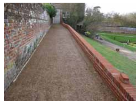
Museum Entrance after