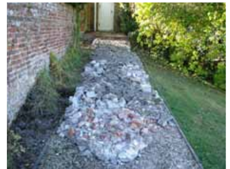
Museum Entrance before

Other access improvements were achieved through management measures such as providing access information about the site, British sign language interpreters on request, induction loops, guided tours and Braille guide books.