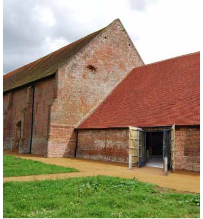
Shop Entrance after